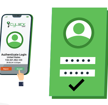
Set New Password